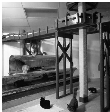
Clean, bright and relatively quiet, the home-like atmosphere of a modern shelter invites visitors to linger and find the right companion.